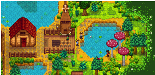
Stardew Valley | All platforms, cozy farming