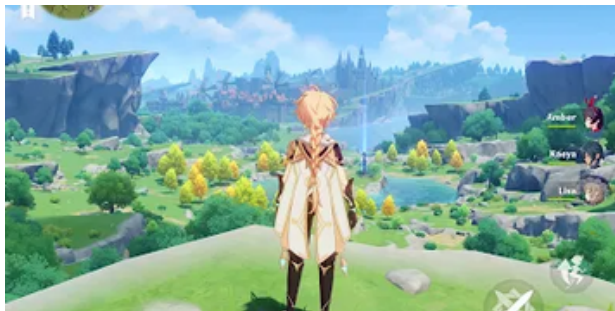
Genshin Impact | Most platforms, adventuring